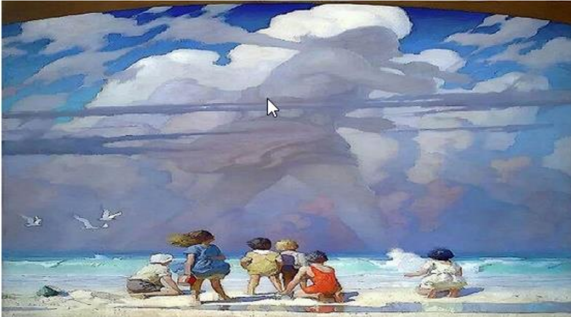
NC Wyeth's painting "The Giant"

Our Quaker beliefs are not idealistic and discarded when the violence of this world comes crashing over us. War has been a constant since the time of early Friends, indeed since the time of Jesus and before Abraham. Through all these times people of faith listen keenly to what God was asking of them. Prayerful listening is particularly intense for teachers who have students living daily with war. What canst thou say is the question of the evening each day as teachers prepare for the next day's lessons knowing that tragedy will likely come to one of the students and hence to all.