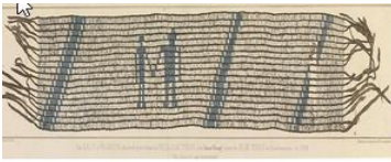
Penn Treaty Belt