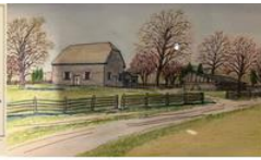
Plymouth Meeting House 1708

As part of our Monthly Meeting's Queries about right relationship with indigenous peoples, we seek to learn the history of Indigenous peoples. This month's topic is The Doctrine of Discovery .